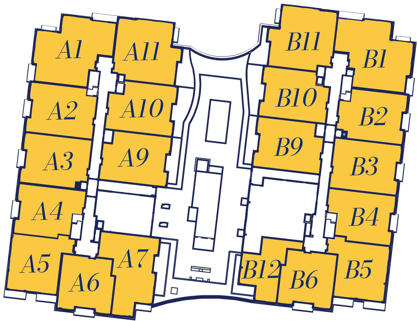
2nd Floor - Amenity Level