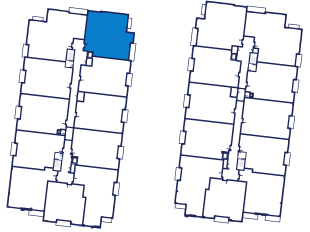
3rd & 4th Level

DEVELOPED BY: RSS CAPITAL NAPLES NEW TOWN VILLAS LLC EXCLUSIVE SALES & MARKETING: THE AGENCY - SK LUXURY GROUP PROPERTY ADDRESS: 4936 TAMiami TRAIL E, NAPLES, FL 34113 TELEPHONE: 239.920.8375 EMAIL: SALES@HELIOSNAPLES.COM WEBSITE: HELIOSNAPLES.COM